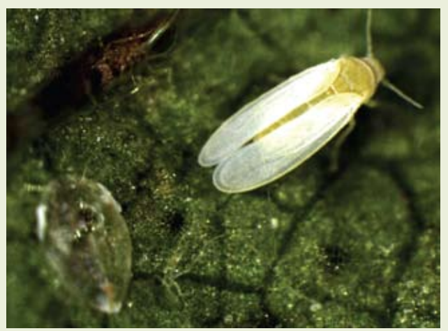
Whitefly nymph and adult

6 • 22nd April, 2014 COTTON STATISTICS & NEWS