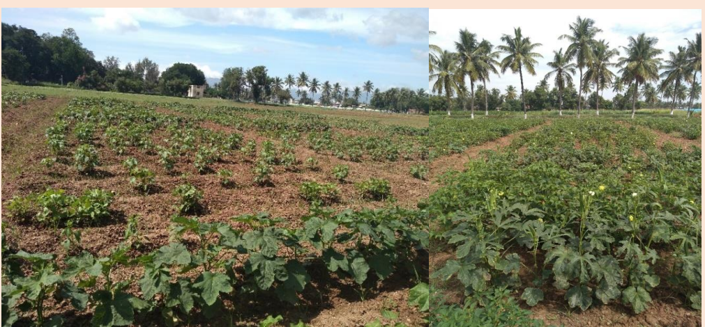
Fig.1. Evaluation of the susceptible/ resistant G. barbadense germplasm lines against TSV under natural conditions